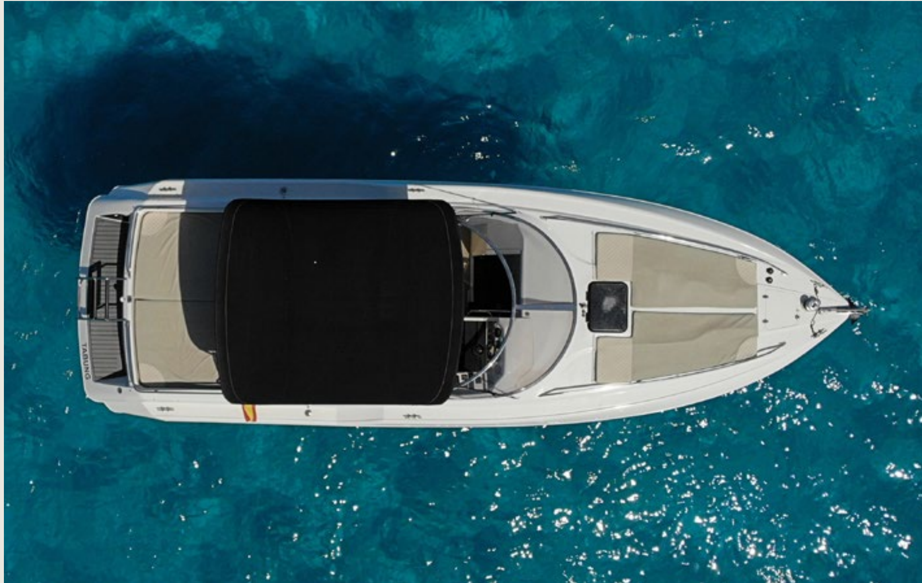
SUNSEEKER MOHAWK 29